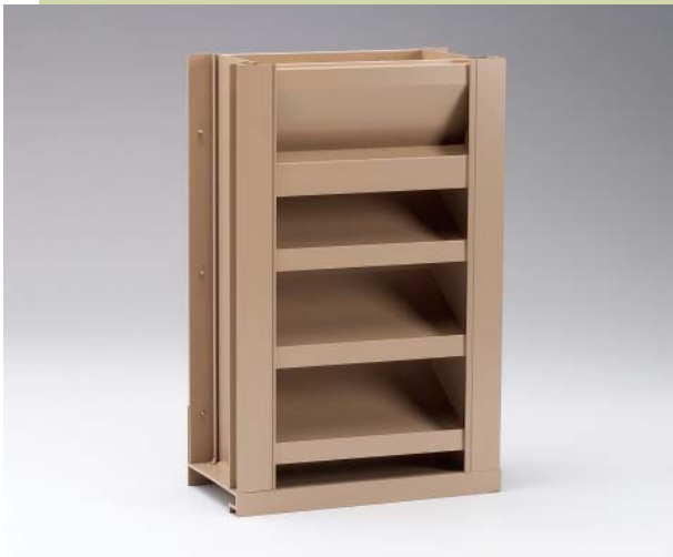
Figure 1: A drainable standard louver.