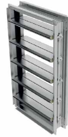
TED50DC Extruded Aluminum (Thermally Efficient)