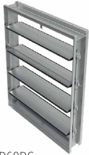
CD60DC Galvanized Steel