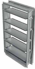
CD50DC Extruded Aluminum