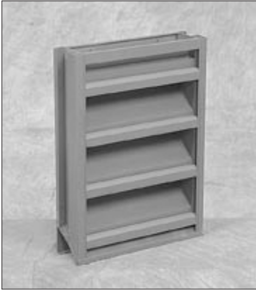
ELF375DX 4" Deep Standard Drainable Design