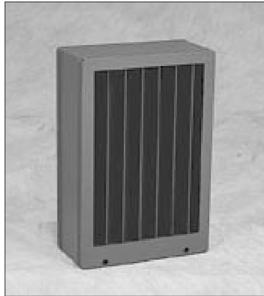
EME6625 6" Deep Wind Driven Rain Resistant Design

RUSKIN ® Specified By Many – Equaled By None