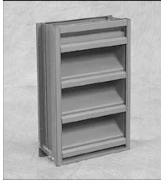
ELF6375DX 6" Deep Standard Drainable Design