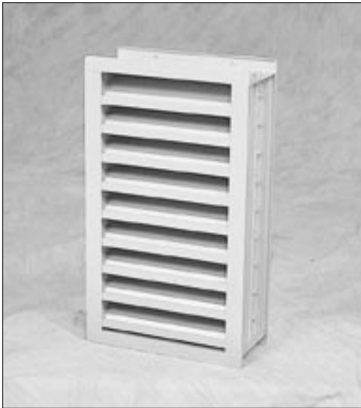
EME520DD 5" Deep Wind Driven Rain Resistant Design